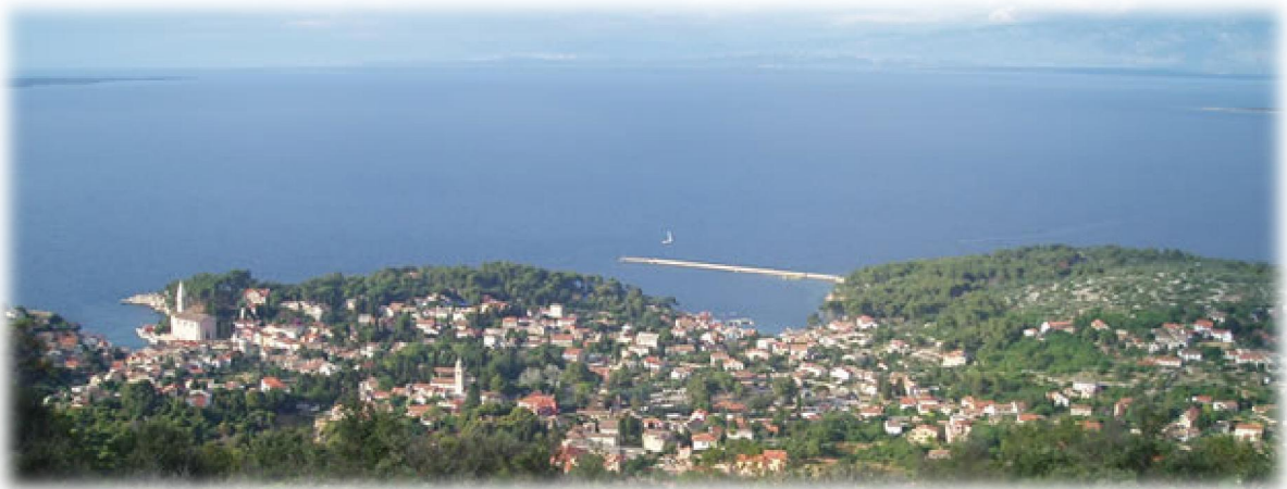
Town of Veli Lošinj - our location