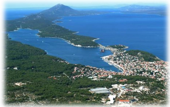
Town of Mali Lošinj

The coastline of Lošinj is extremely diverse; it consists of many large and small bays and underwater caves. The field-base is located in the old village of Veli Lošinj (3 km distant from Mali Lošinj – the biggest island town in Croatia) on the sheltered east coast of the island. The water falls to a depth of around seventy metres; the seafloor is mainly mud, with areas of sea-grass and limestone reefs. There are more than 95 species of fish found in these waters, and other top predators such as loggerhead turtles, tuna, sharks and swordfish regularly visit this area. The marine environment around Lošinj is the cleanest part of the Northern Adriatic Sea, with underwater visibility of consistently over twenty metres. We encourage you to explore the island and take advantage of the untouched natural environment that surrounds you.